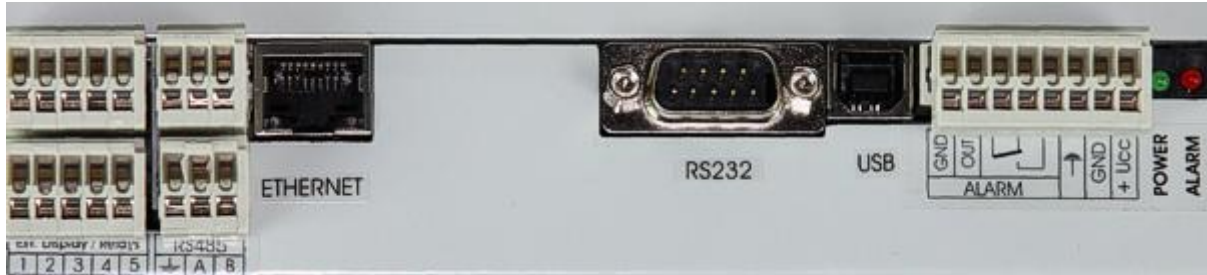
Figure: communication interface, alarm outputs, connection of power. Ethernet interface is optional.